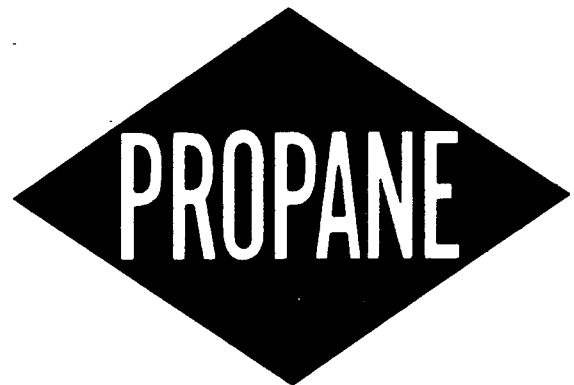
Figure 3-6.2.10 Example of Vehicle Identification Marking

3-6.2.10 Marking. Each over-the-road general purpose vehicle powered by LP-Gas shall be identified with a weather-resistant diamond shaped label located on an exterior vertical or near vertical surface on the lower right rear of the vehicle (on the trunk lid of a vehicle so equipped, but not on the bumper of any vehicle) inboard from any other markings. The label shall be approxi-