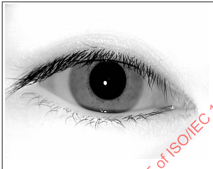
Figure 1 — Example of Uncropped Iris Image or VGA Iris Image

The VGA Iris Image type shall be identified in the record structure of clause 7 by assigning a value of 2 to the type field on line 9 of Table 4.